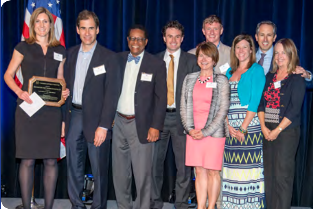
Law Firm of the Year Recipient Brownstein Hyatt Farber Schreck, LLP

We are delighted to honor our volunteers and contributing law firms at our annual Awards Luncheon each May. Photographs of some of our 2016 honorees are included on these pages.